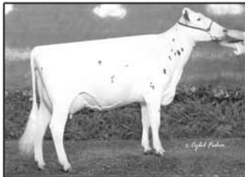
EL-PASO LARO PHEBES PITCH WHITE

Her Fall Calf by Lotto sells born right to show!