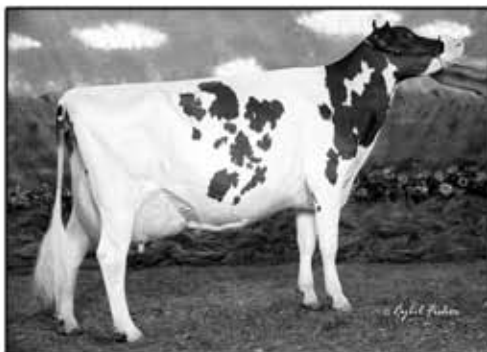
COVEY-FARMS FOREVER JADE

All-American 5-Year-Old, 2005 Her Fall Calf by Loto sells!