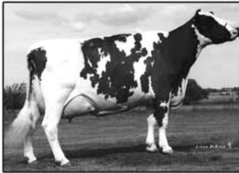
FAMILY-AF-AYR DK DESIREE

GRAND NATIONAL AYRSHIRE SALE, DUBUQUE, IOWA ~ JUNE 19 ~ 6:00 P.M.