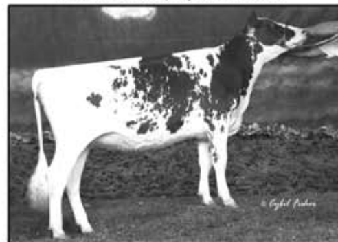
MACKAYR ROMEO'S PAULA Very Good-85

Sale catalog will be online at: www.usayrshire.com by June 1st